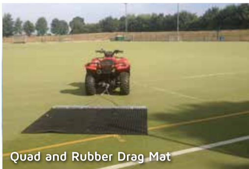
Quad and Rubber Drag Mat