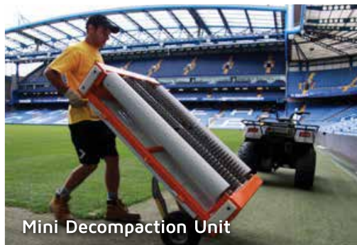
Mini Decompaction Unit