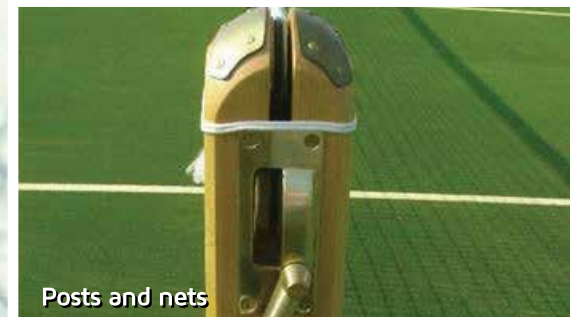
Posts and nets