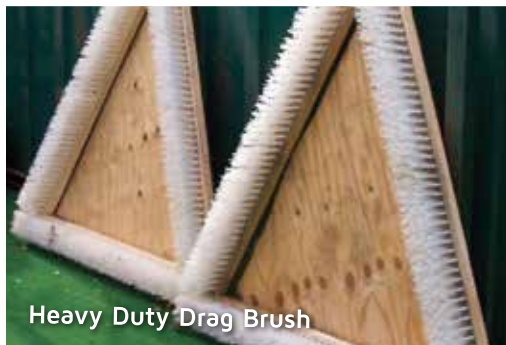
Heavy Duty Drag Brush