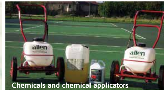
Chemicals and chemical applicators